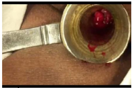
2<sup>nd</sup> degree pile mass with Bleeding

Application of Rajani Lepa found effective in this 2<sup>nd</sup> degree internal haemorrhoids within 15days the patient was followed up regularly and by doing proctoscopic examinations in each visit and there is no evidence of recurrence of bleding Haemorrhoid, patient was on active treatment for 2months ,diet restriction followed. Combination of Raiani Lepa, conservative treatment, diet restriction and lifestyle modification over a period of 1 year.