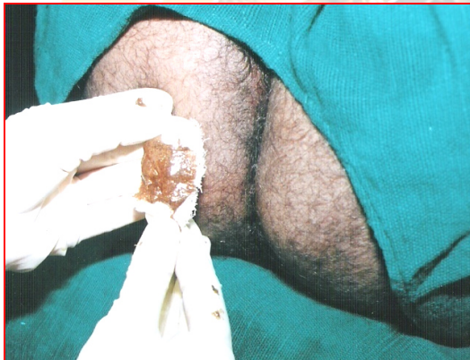
APLICATION OF MADHUYASHTYADI GHRITA