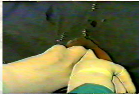
MANUAL ANAL DAILATION